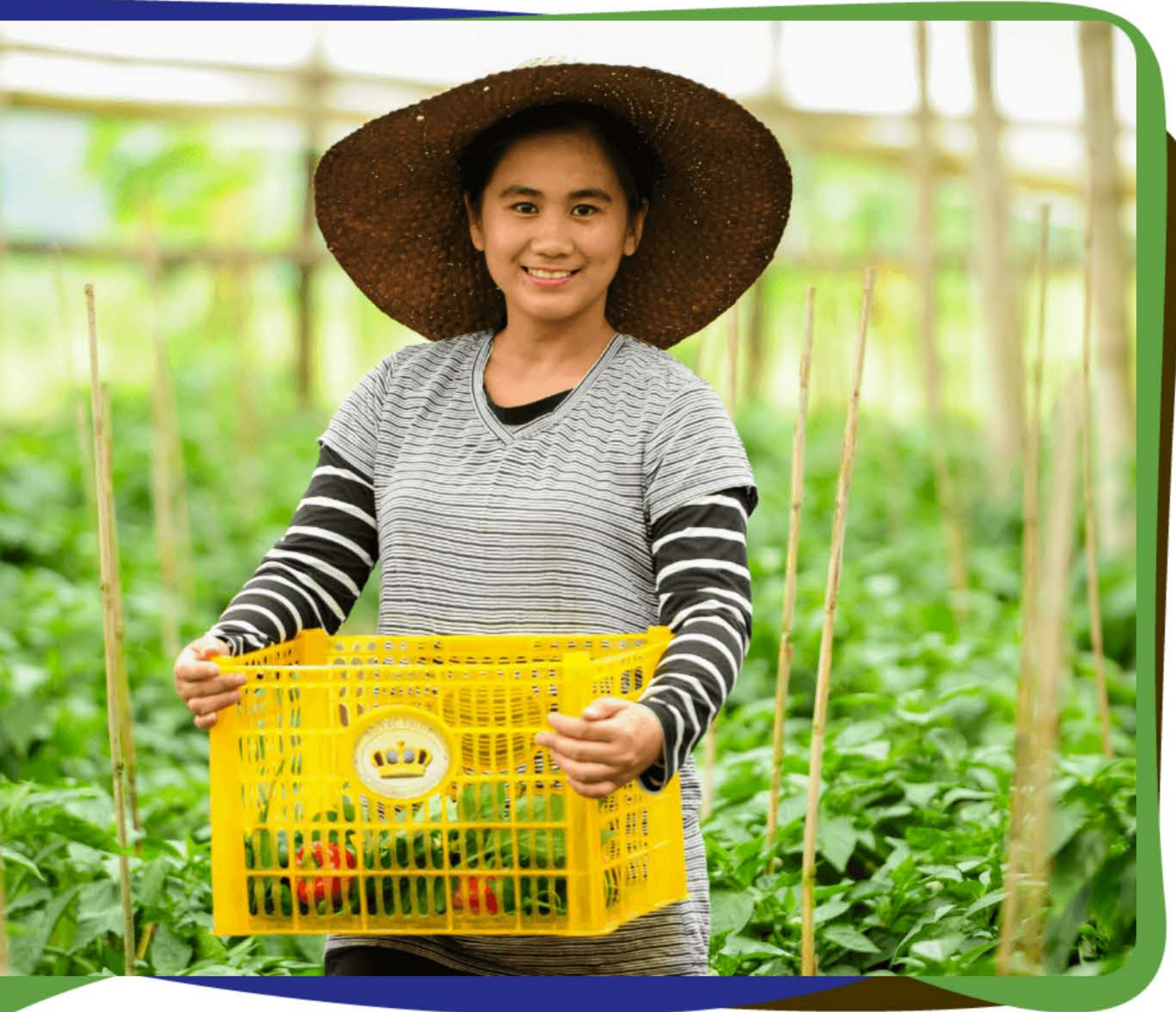
One of the FEP farmers from Kapangan, Benguet, who supply bell peppers to JFC