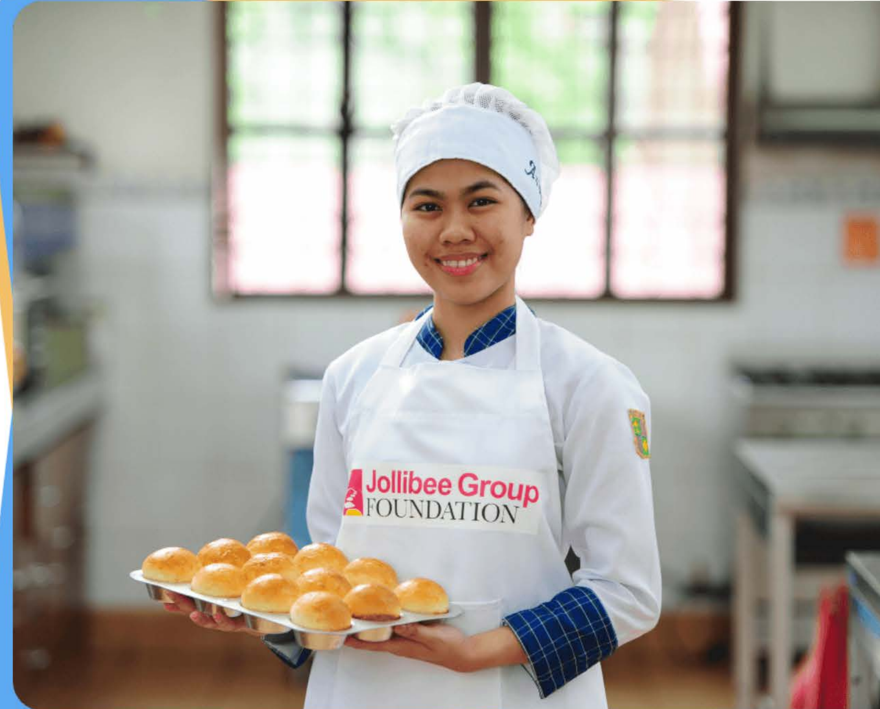
One of the first QSRO scholars under the ACE Scholarship Program

The ACE Scholarship Program has been mostly focused on technical-mechanical and agri-related courses offered through eight Don Bosco training centers across Luzon, Visayas, and Mindanao. In 2018, JGF broke new ground with its partnership with Anihan Technical School in Calamba, Laguna, to offer Quick Service Restaurant Operations (QSRO). The new curriculum fills the gap for professionalized personnel training for the fast-growing food service industry. All of the 27 graduates from QSRO's inaugural batch have found employment.