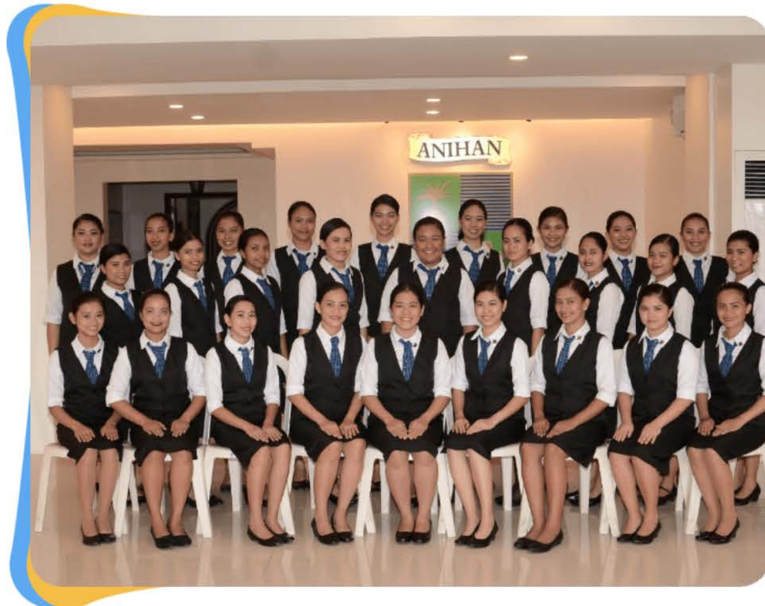
1 The first batch of Quick Service Restaurant Operations (QSRO) scholars graduated from Anihan Technical School in Laguna. All 27 of them are employed in food service institutions, including Greenwich.