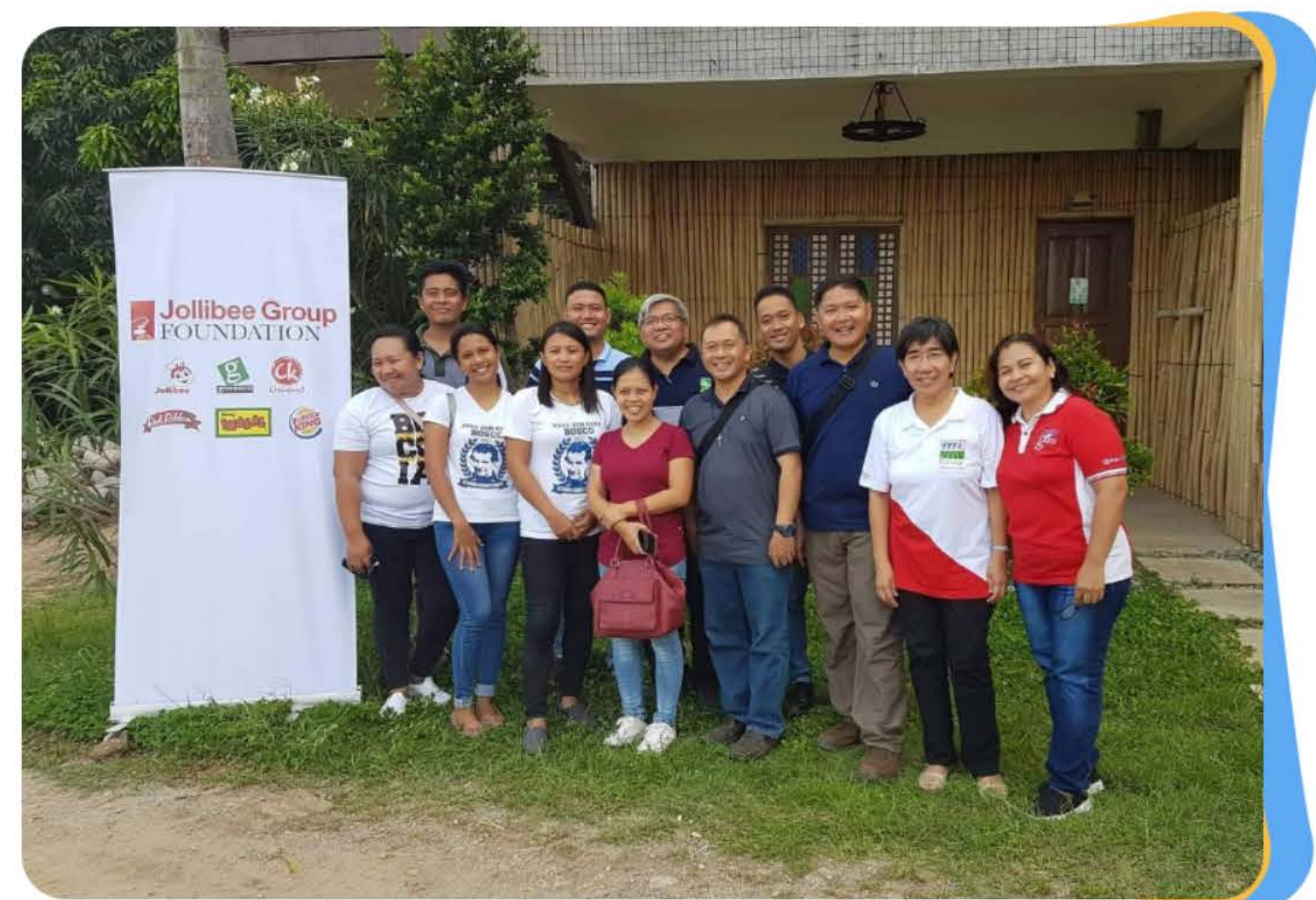
4 Don Bosco faculty members obtained Technical Education and Skills Development Authority (TESDA) certification for Agro-Entrepreneurship (AE), a milestone that brings closer a formal AE curriculum technical-vocational track.