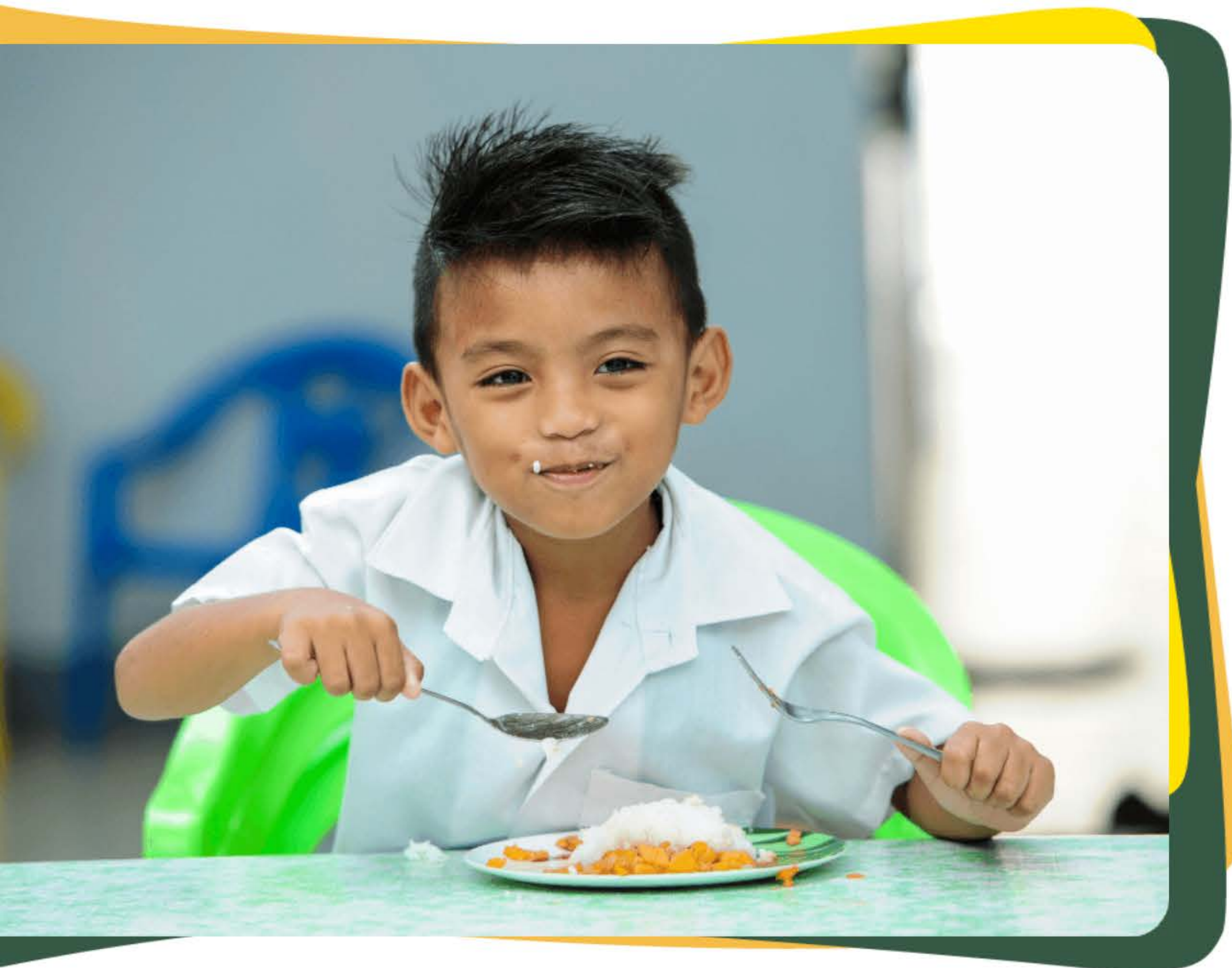
A pupil at the BLT Kitchen in Lupang Pangako Elementary School, Payatas, Quezon City