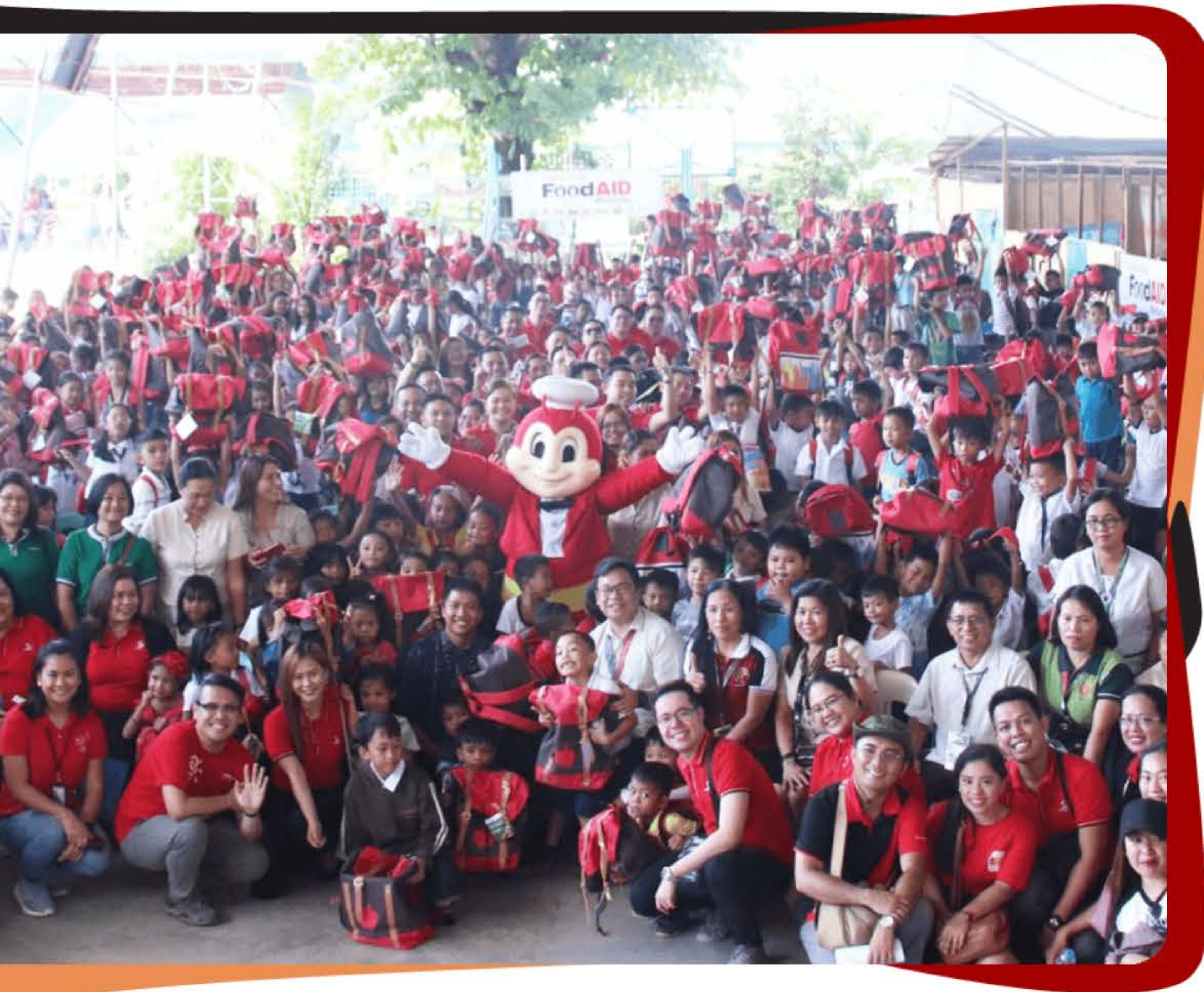
JGF partnered with Jollibee to bring "Maaga ang Pasko" to Kidapawan City, Cotabato, one of the cities most affected by the Mindanao earthquakes